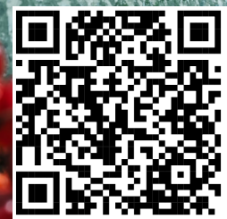
GIVING QR Code