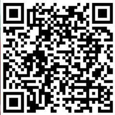
GIVING QR Code

Saint Aloysius Gonzaga Parish Annual Report 2024