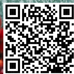
GIVING QR Code