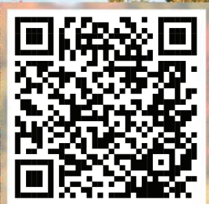
GIVING QR Code