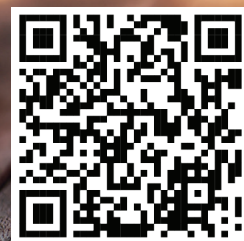
Giving QR Code

Saint Bernard of Clairvaux Parish Annual Report 2023