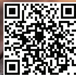
Giving QR Code

Saint Vincent Basilica Parish Annual Report 2023