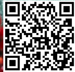
GIVING QR Code

Christ the King Parish Annual Report 2024