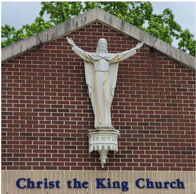
Christ the King Church