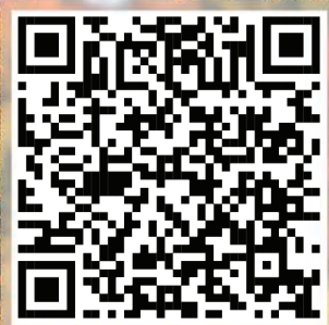
GIVING QR Code

The Epiphany of Our Lord Parish Annual Report 2025