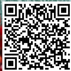
GIVING QR Code