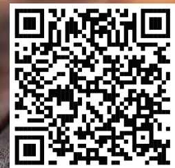
Giving QR Code