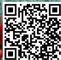
GIVING QR Code

Saint John the Baptist Parish Annual Report 2024