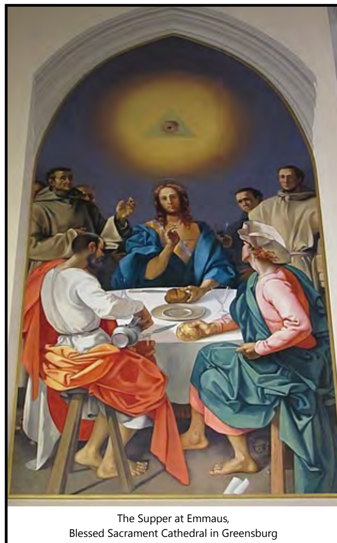
The Supper at Emmaus, Blessed Sacrament Cathedral in Greensburg

To create exciting and appealing models of faith formation, all Catholics must build relationships both within the individual parishes and across the Diocese. In today's world, there is an increased desire for community and relationships after the social isolation that occurred during the pandemic. Our parishes are ideal locations to build welcoming Christian communities that nourish the spiritual and social needs of God's people. The most recent Directory for Catechesis recognizes this essential need, "Catechesis... has the task of developing the sense of belonging to the Church; teaching the sense of ecclesial communion... forming believers in the sense of ecclesial co-responsibility , contributing as active participants to building up the community and as missionary disciples to its growth" ( DC , 89). This sense of co-responsibility can only be established through the building of relationships within the parish between the pastor and his people, the catechists and their students, the catechists and parents, and parents and students amongst themselves. The ability to proclaim the Gospel is rooted in the "art of accompaniment," which is "an openness of heart which makes possible that closeness without which genuine spiritual encounter cannot occur" ( EG , 171). This pastoral plan will encourage relationship building within parishes, inviting those on the peripheries of the community to feel welcome and valued. Additionally, this plan